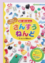
プレ NEO ブックス さんすうねんど (小学館)