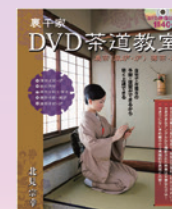
裏千家 DVD 茶道教室 濃茶(風戸・炉) 薄茶・炉 北見宗幸著 (山と溪谷社)