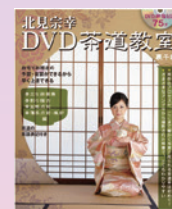
北見宗幸 DVD 茶道教室 裏千家 (山と溪谷社)