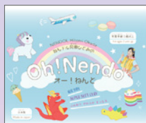
オー！ねんど 【ねんど教室でもよく使用する とっても使いやすい軽量ねんど】