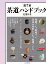
裏千家 茶道ハンドブック 北見宗幸著 (山と溪谷社)