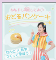
形状記憶合金 LABO おどるパンケーキ (吉見製作所)