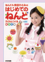
ねんど岡田ひとみの はじめてのねんど 子どもとつくる年中行事 (鈴木出版)