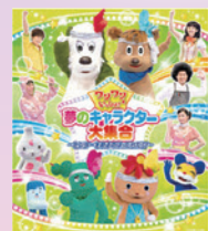
ワンワンといっしょ！ 夢のキャラクター大集合 ～センターを取るの、だれだ！？～ 【DVD&Blu-ray】(日本コロムビア)