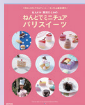
ねんど岡田ひとみの ねんどでミニチュア パリスイーツ (主婦の友社)