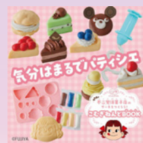
二不家洋菓子店の ケーキをつくらう！ こむぎねんど BOOK (宝島社)