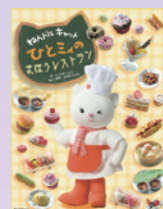
ねんどキャットひとみとの まほうのレストラン 【いりやまとしとのコラボ レーション絵本】(学研プラス)