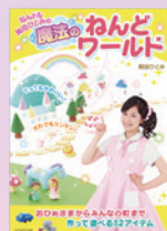
ねんど岡田ひとみの 魔法のねんどワールド (じゃこめてい出版)