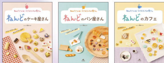
「ねんどでつくる！小さなたべもの屋さん」シリー ズ (汐文社)